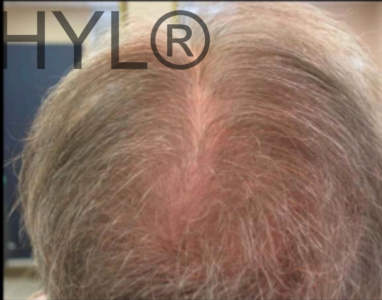
63 yr old male-5 months after 3 rd treatment with PRFM